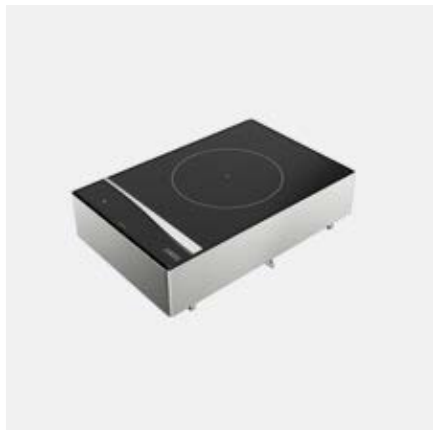
Induction Mono Zone