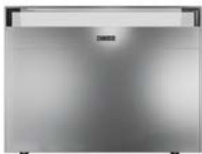
Standard version in high grade stainless steel (AISI 304)