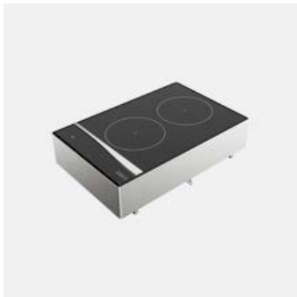
Induction Double Zone