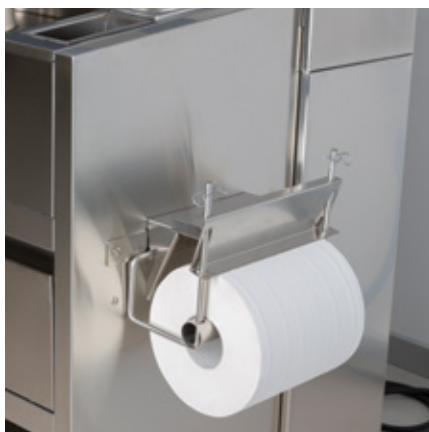
Paper towel support

To make your working area even more efficient.